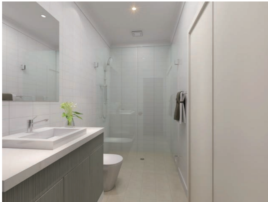
Shown with frameless shower screen upgrade